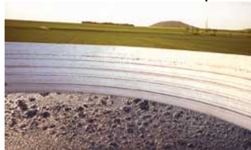
This is 4 weeks after the installation of a Weber Isis-Activator. You can see oxygen bubbles coming out of the manure and there is a formation of Humus.