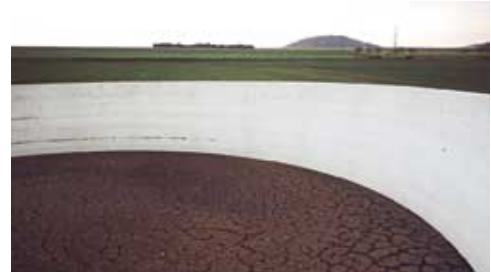
Manure without a Weber-Isis Activator. You can see thick crust on top.