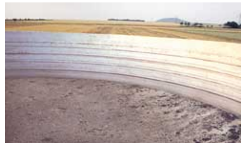
This is 8 weeks after the installation of the Activator. You can see that it is in liquid form and it is continuously homogenized.